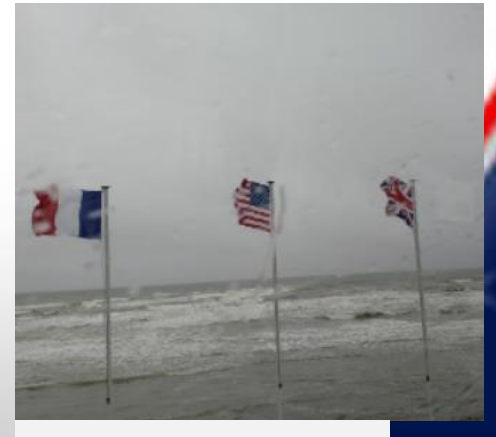
We remember Omaha Beach, Normandy